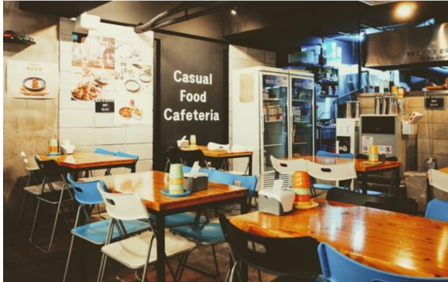
Casual Dining Restaurant