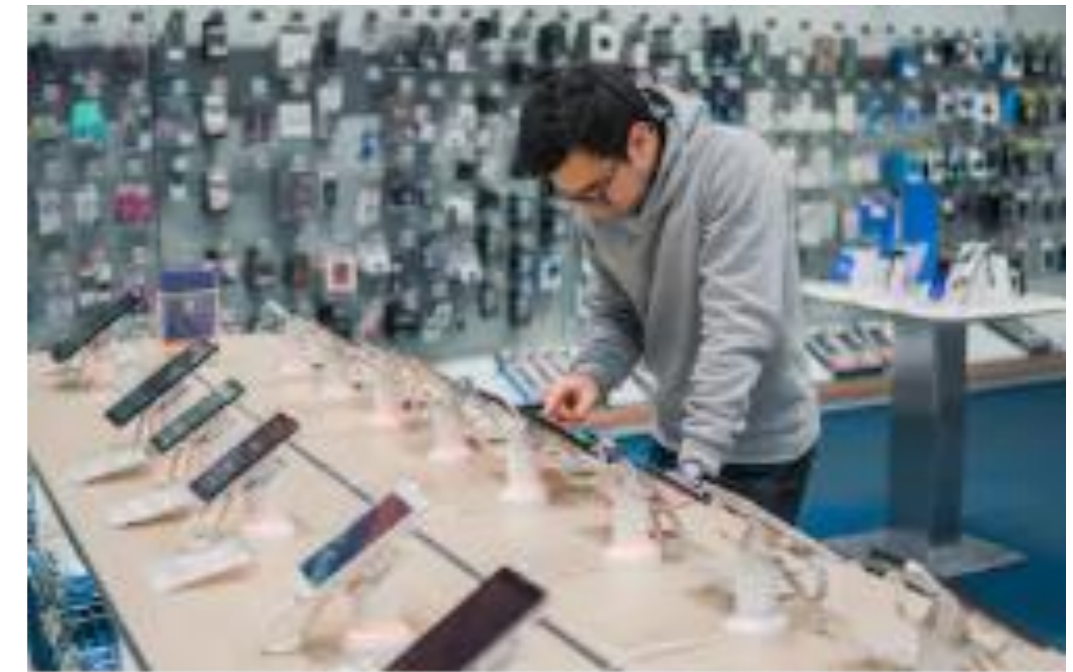
Consumer Electronic Shop