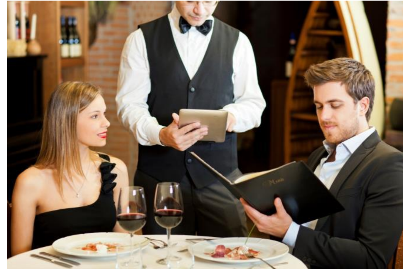
Fine Dining Restaurant